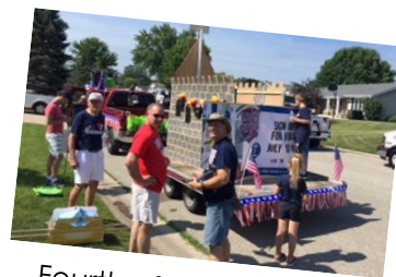
Fourth of July Parade