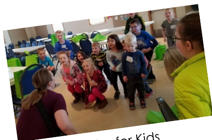
Easter for Kids