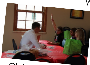
Christmas for Kids