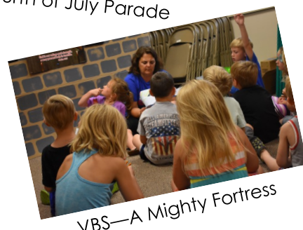
VBS—A Mighty Fortress